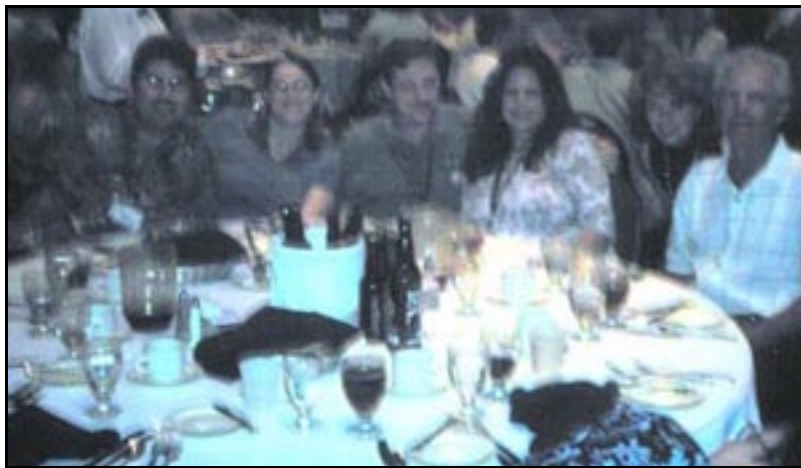
"Beer and Loafing in Las Vegas!!!"